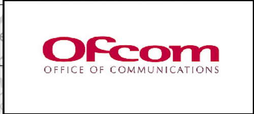
London AM3 MCA (Spectrum Radio) - 29th December 2003